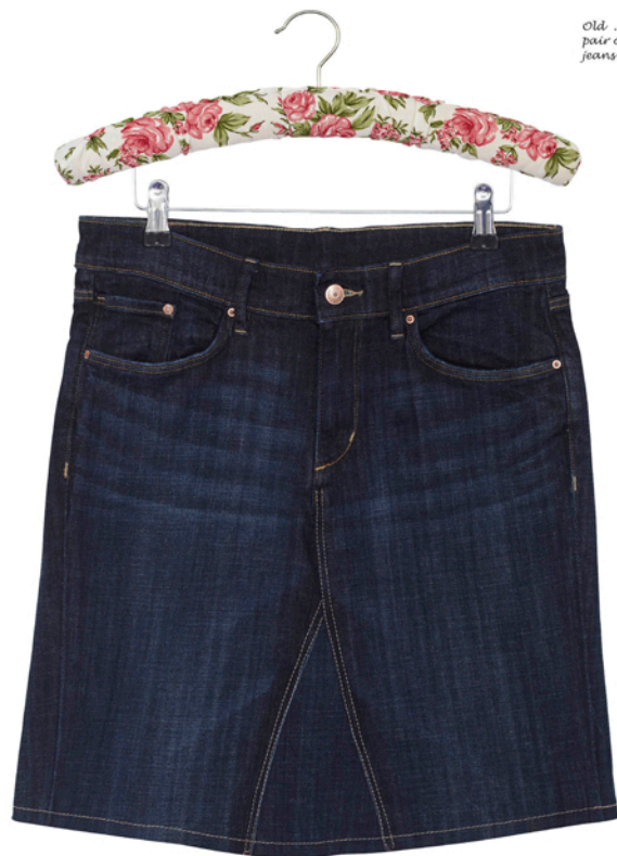
Old pair of jeans

Turning old jeans that are too short or have ripped legs into a little skirt is so easy. You don't even have to make a hem; a row of stitches at the bottom edge is enough to stop it fraying. Wear it with a T-shirt for a casual yet trendy holiday outfit.